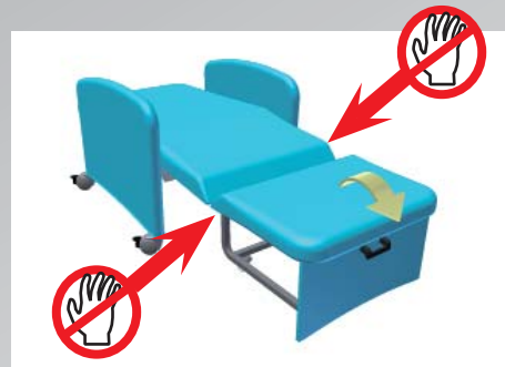
When fully extended the bed surface is flat and level.