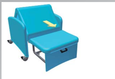
Pull seat unit forward letting it roll on floor. No need to lift!