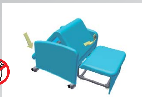
Push the middle section to form the 'back' of the chair