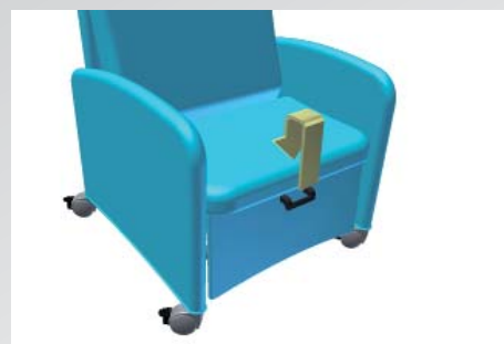
Push the chair back until the front of the seat drops into position.

Sleep with feet towards the handle on the front of the chair.