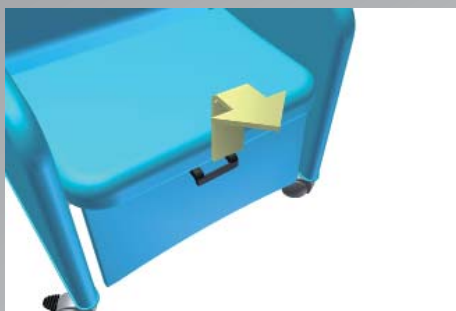
Lift up front edge of seat with handle.