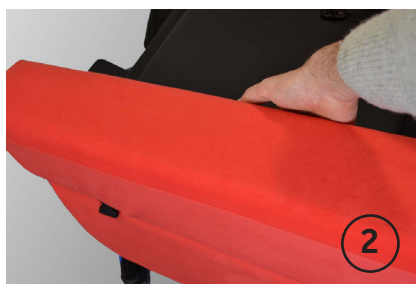
increase seat width